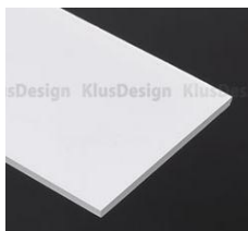
cover type HSP47 frosted (17051) transparent (17062)