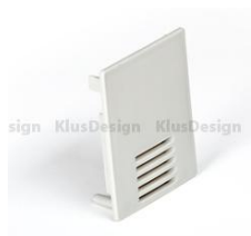
end cap IKON (24013)