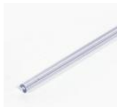
security rod (00806)